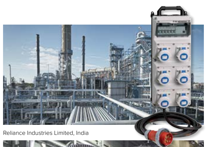
Reliance Industries Limited, India