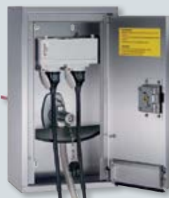
2 Stainless steel distributors