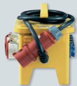
EverBOX® Grip – mobile distributors