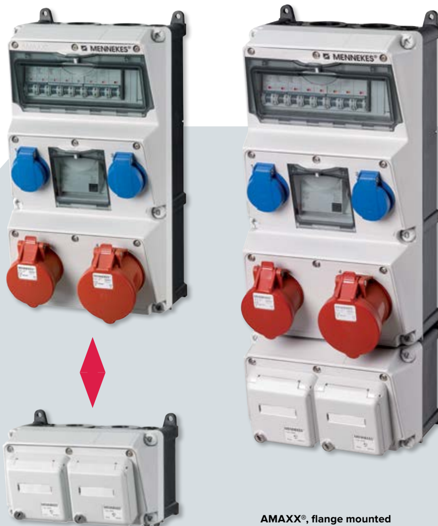
AMAXX®, flange mounted