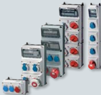
1 AMAXX® receptacle combination