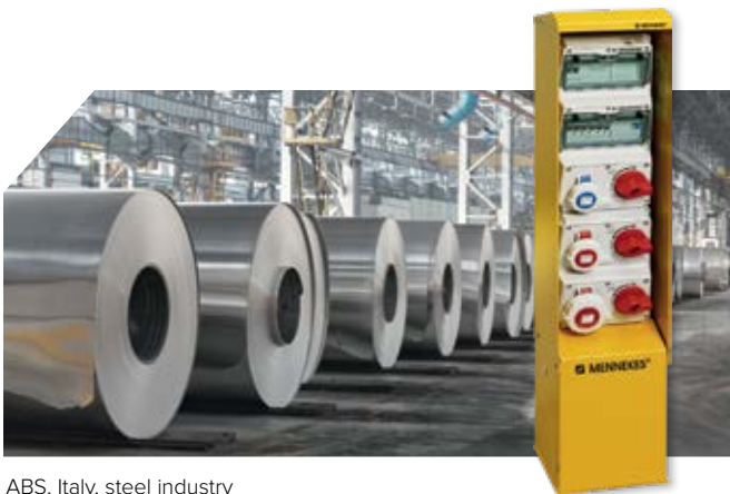
ABS, Italy, steel industry

and a passion for developing custom made solutions. For use all round the world.