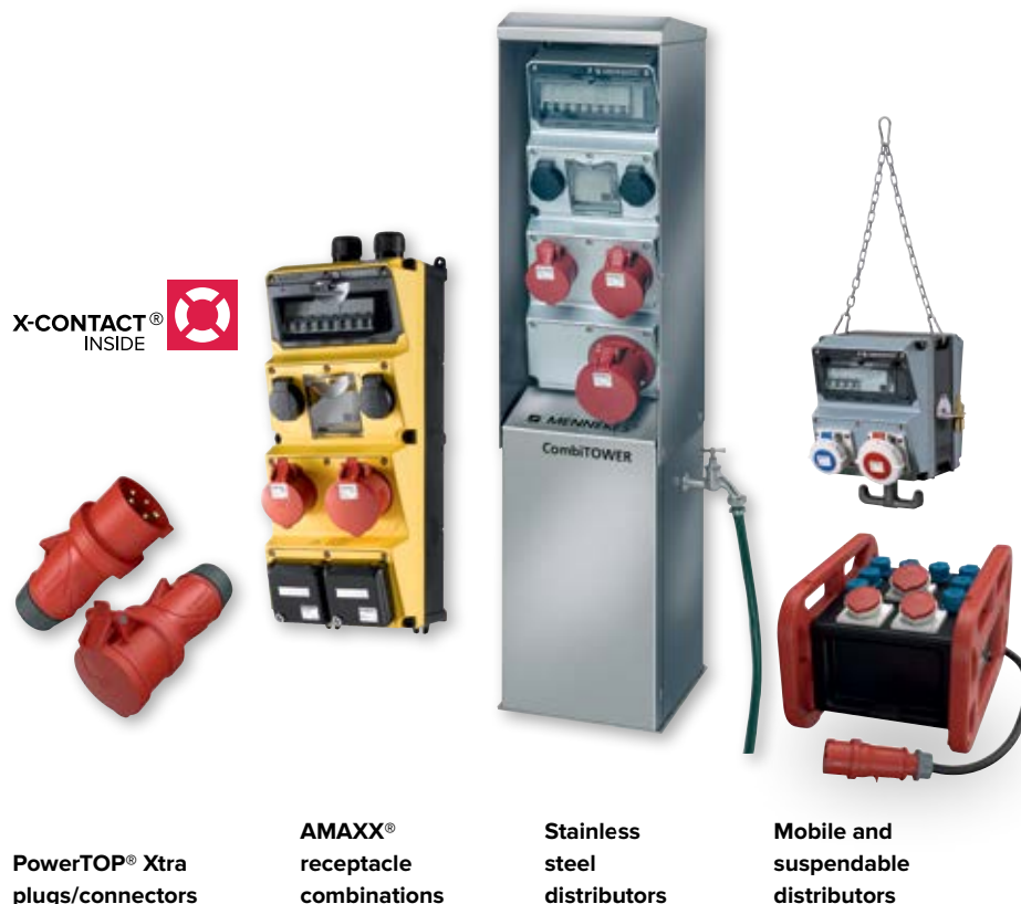
PowerTOP® Xtra plugs/connectors

Whether the machine layout changes in production, or test laboratories have to be converted to new processes, or routes for forklifts and pallet trucks have to be kept flexible, suspendable combinations together with a cleverly planned hall distribution can help avoid future problems before they can arise.