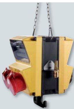
1 AMAXX® suspendable