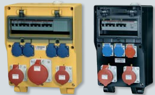
3 EverGUM receptacle combination